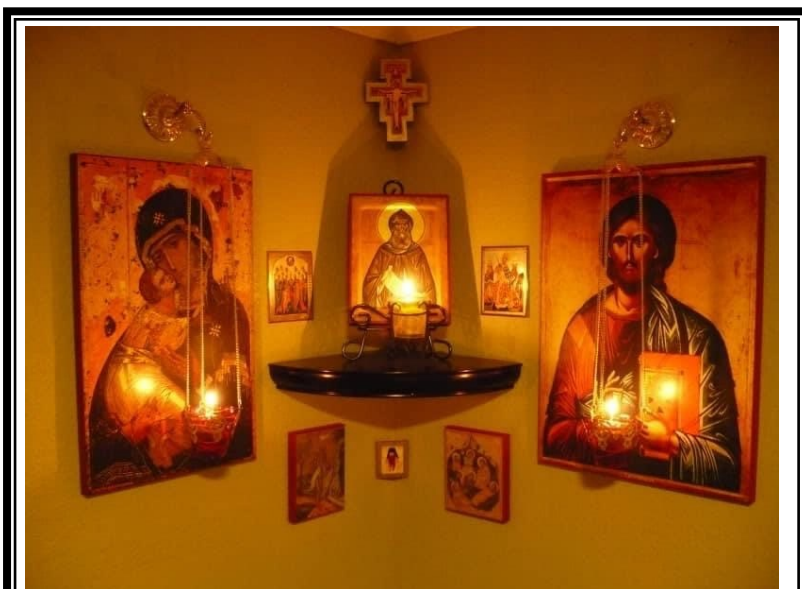
Your Prayer Corner!

The New Testament is centered upon the person and work of Jesus Christ and the outpouring of the Holy Spirit in the