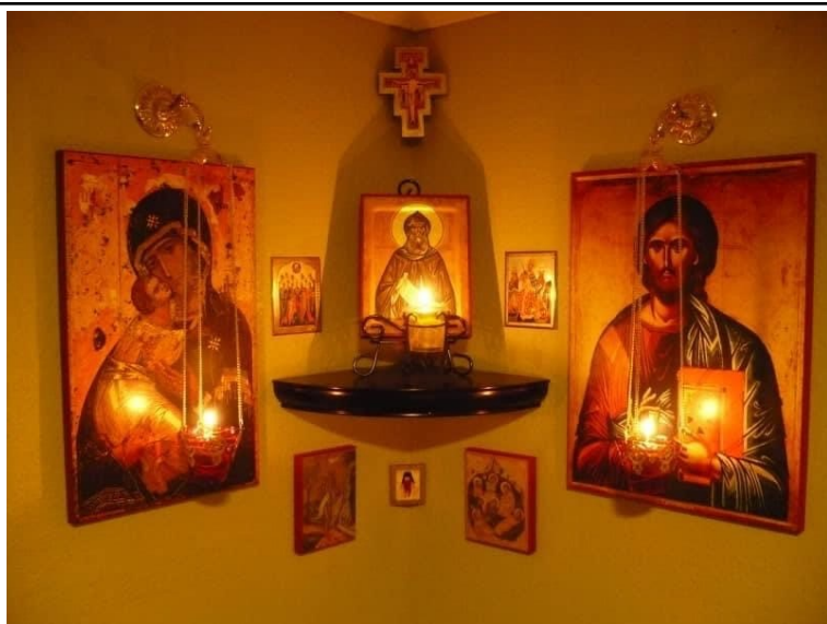
Your Prayer Corner!