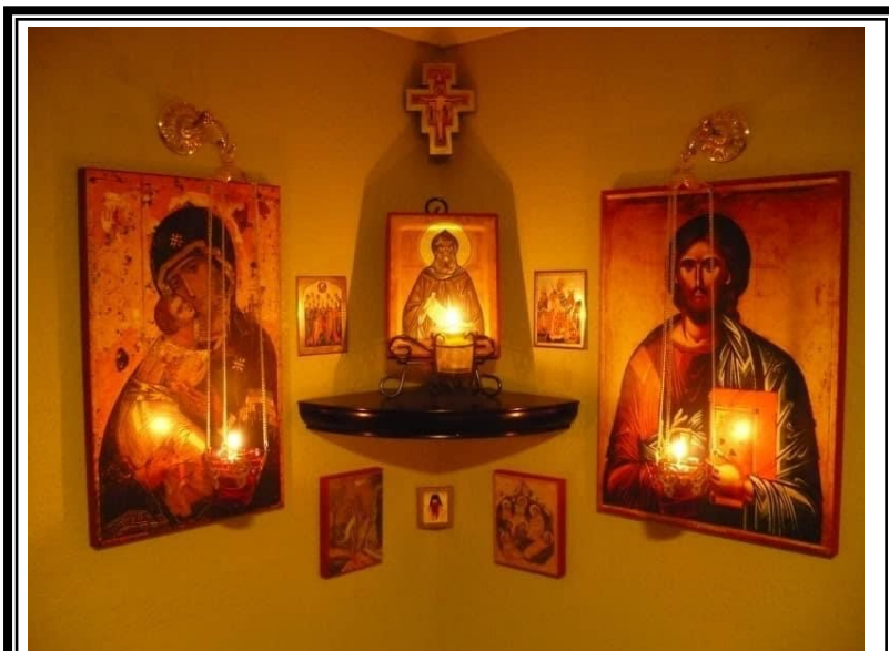
Your Prayer Corner!

“God grant to the living, grace; to the departed, rest; to the Nation, peace and concord; to us all Your servants the promise of everlasting life, light to guide us on our way, courage to support us, and Your blessing to unite us in service to You our God and this our Country. Amen.”