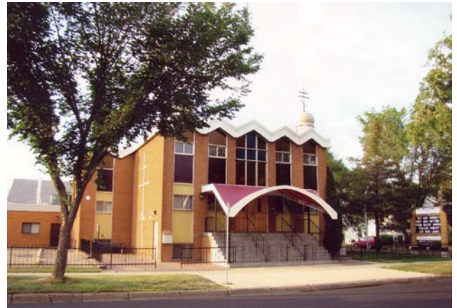
St. Michael The Archangel Ukrainian Orthodox Church